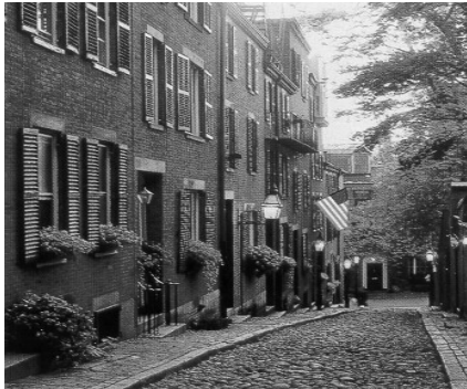
Boston's Beacon Hill

Please note that entrance to any government facility is subject to change due to security reasons. Please bring a photo ID.